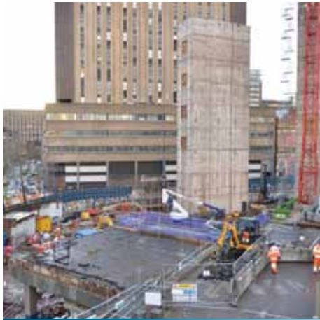
John Lewis site

Façade: The first of 8000 reflective stainless steel panels for the new station façade have been installed; transforming the old station exterior and giving passers by a first glimpse of the future stunning design for the station.