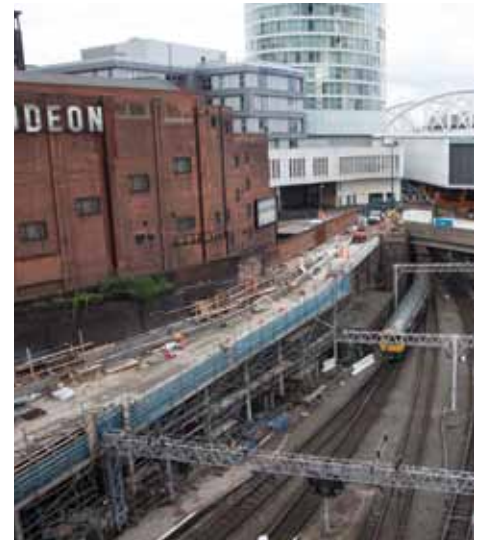
Moor St link

Elsewhere in the Pallasades, demolition is ongoing in several areas including demolition in the centre of the building to form the new atrium which will open in 2015. The Pallasades shopping centre will remain open throughout the redevelopment.