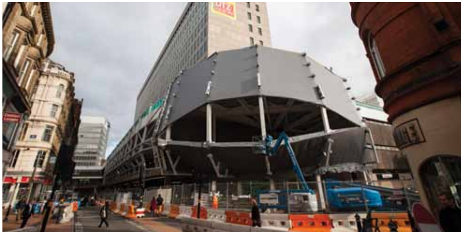
Your new entrance

Moor Street link: This walkway provides a new pedestrian route, opening alongside the new concourse in April providing a link between Moor Street station, Smallbrook Queensway and the new concourse via Stephenson Street.